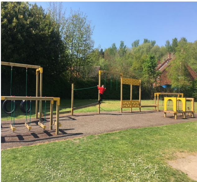
Our Adventure Trail.